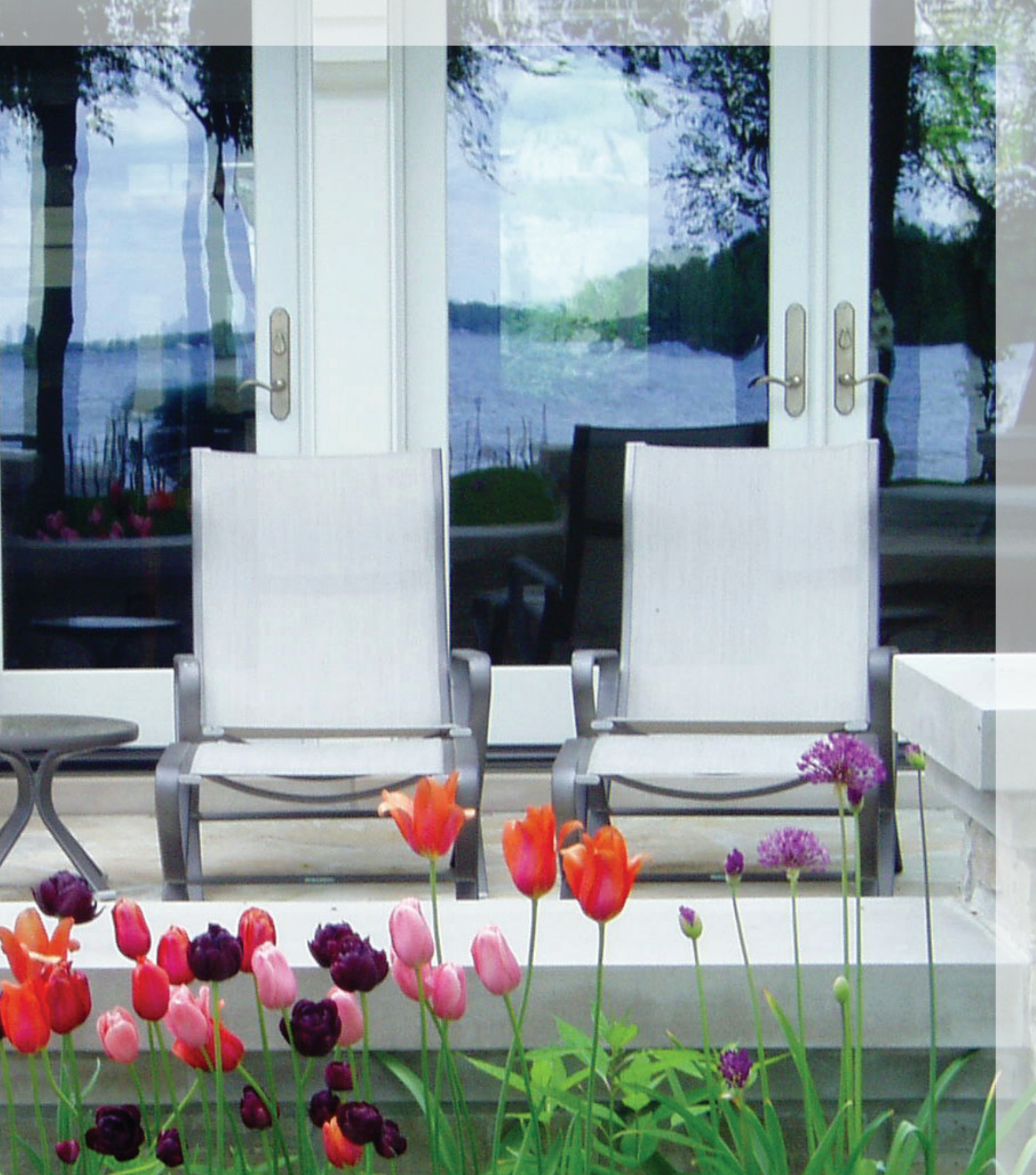
Residence in Lake Minnetonka collaboration with YardScapes