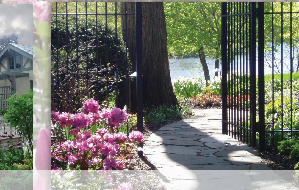
Lake of the Isles Minneapolis