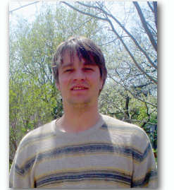
Andis Skromanis Landscape Installation